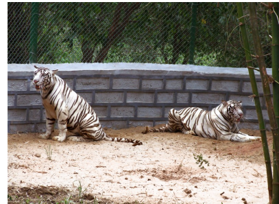
Nandan Kanan Zoological Park, Bhubaneswar