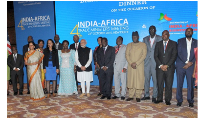
Prime Minister meets African Trade Ministers

Ministerial meeting of 3rd IAFS was held on 27th October. In her address, External Affairs Minister Ms. Sushma Swaraj spoke about India and Africa's longstanding ties and presence of 3 million strong Indian diaspora in Africa and their contribution to their home countries. She mentioned about the cooperation between India and Africa on trade and investments. She also recalled India's active participation in the international efforts to meet the challenges posed by pandemics including Ebola and HIV/AIDS in Africa.