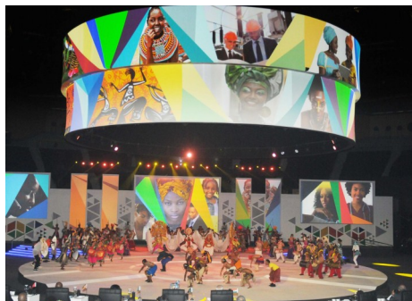
Cultural Programme at the Summit