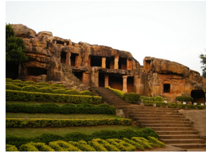
Udaygiri Caves, Bhubaneswar

Around 60 kms from Bhubaneswar is Puri. It is one of the four main Hindu pilgrim centres in India and is famous for its Jagannath temple. The 65 metre high temple built in 12th century is one of the most magnificent monuments of India. A 16-sided monolithic pillar stands in front of the main gate. Two stone lions guard the Eastern main entrance. Golden beach in Puri is famous for its golden sand, surf and sun. Early morning sunrise is a beautiful sight on the beach. Some of the other important temples are Gundicha, Lokanath, Sunaragauranga, Daria Mahabir and Tota Gopinatt. There are a number of holy tanks such as Narendra, Markandeya, Sweta Ganga and Indradyumna. There are many monasteries locally known as Mathas, which are also of touristic interest.