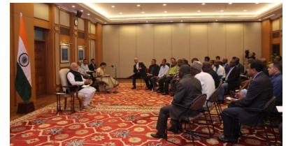
PM interacts at India-Africa Editors Forum