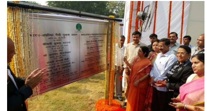
Inauguration of India-Africa Friendship Rose Garden