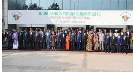
Foreign Ministers Meeting