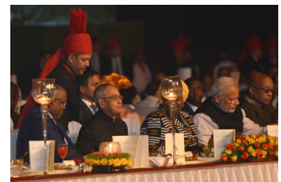
President hosts Banquet