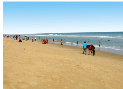
Golden Beach, Puri