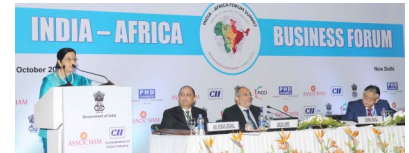
India-Africa Business Forum