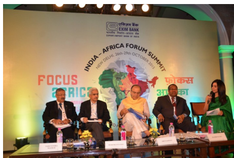
Seminar on Focus Africa