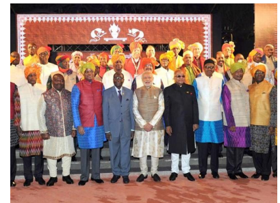
At dinner hosted by Prime Minister