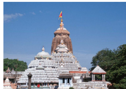
Jagannath Temple, Puri