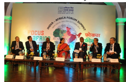
Seminar on Focus Africa