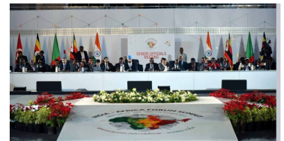
Senior Officials Meeting