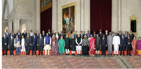
President meets African Leaders