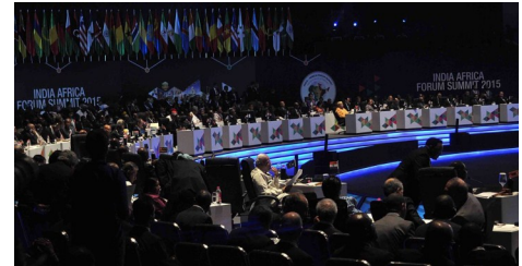
Prime Minister attends the Summit