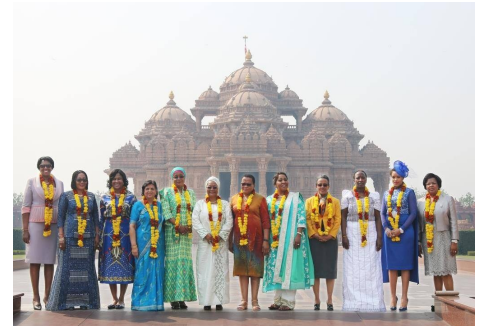
First Ladies from Africa visit Swaminarayan Akshardham