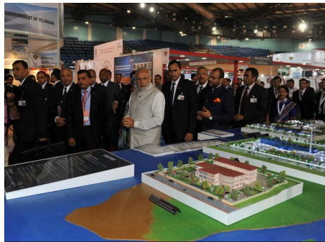
Prime Minister visits Business Exhibition