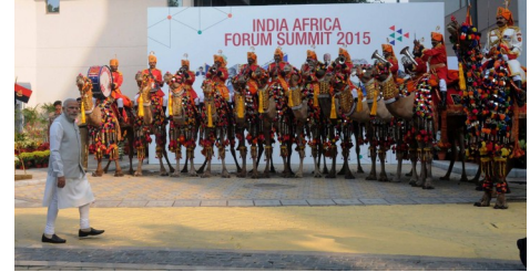
Prime Minister arrives for the Summit