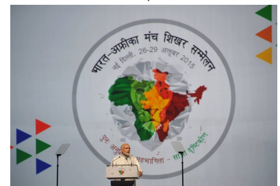
Prime Minister addresses the Summit