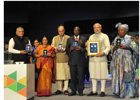
Dignitaries release commemorative coins and stamps