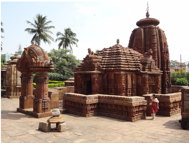
Mukteswar Temple, Bhubaneswar